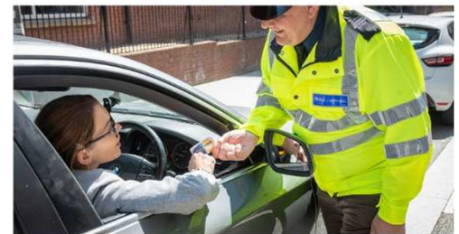
Week-long air quality monitoring to take place in city